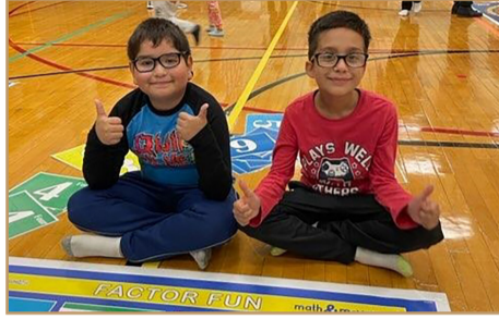
Bayview Avenue School