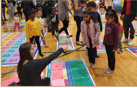
Archer Street School

At Archer Street School, Bayview Avenue School, Leo F. Giblyn School and New Visions School, Math and Movement Family Fun Nights brought students and families together engaged in activities designed to reinforce the math curriculum. Parents and students moved from station to station engaging in high-energy kinesthetic activities. Students used fun floor mats and wall charts to build upon their math and reading skills through movement.