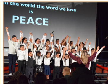
Archer Street School