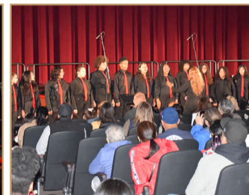
J.W. Dodd Middle School