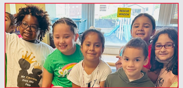
New Visions School.