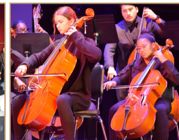
Freeport High School sinfonietta