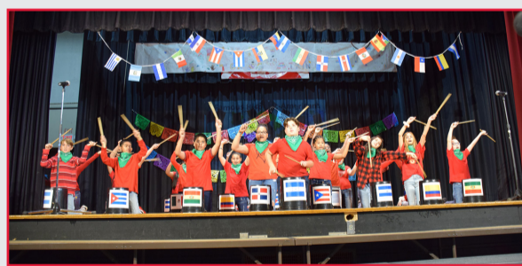
Caroline G. Atkinson Intermediate School bucket drummers