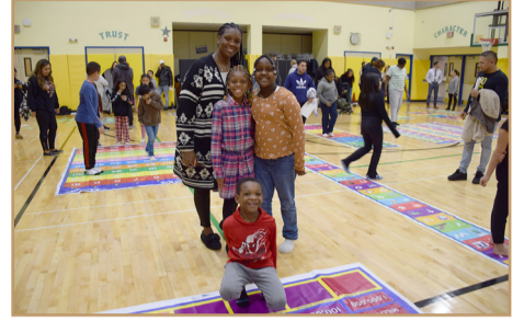
New Visions School

Engineers Teaching Algebra is a new approach to teaching algebra to eighth grade students. ETA is a one-lesson-plus engineering challenge where the pace and emphasis adapts to a range of skills as students work on various challenges. The objective is to demonstrate the everyday value of algebra to provide a fun and engaging window into engineering and to encourage the pursuit of math and science studies.