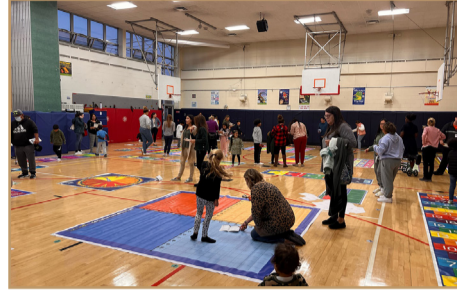
Leo F. Giblyn School