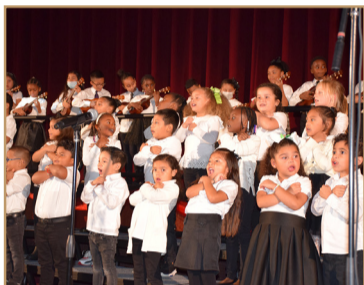
Columbus Avenue School and Bayview Avenue School