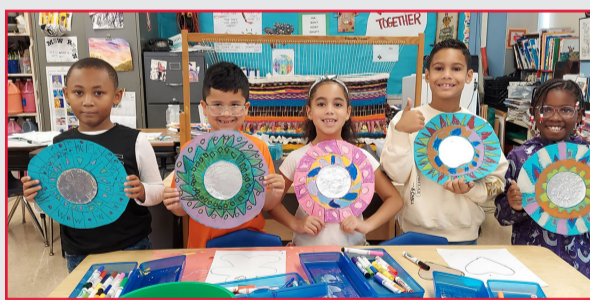
Leo F. Giblyn Elementary School art students