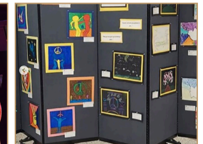
Districtwide art exhibit